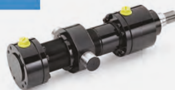
▲ Hydraulic cylinders ISO6022, also with trasducer (CCT).