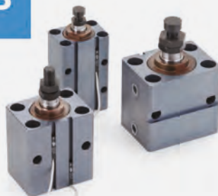
▲ Short stroke cylinders, also with sensor switches - Bore from 25 to 100mm.