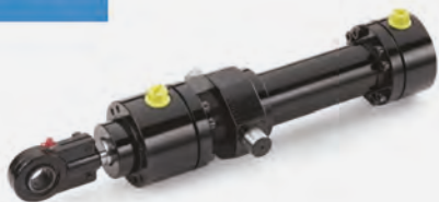
▲ Hydraulic cylinders ISO6020/1, also with trasducer (CAT).