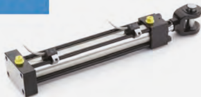
▲ Hydraulic cylinders with sensor switches ISO6020/2, DIN24554.