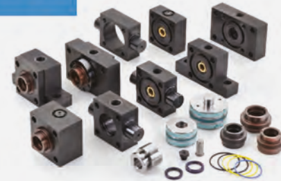
▲ Components and seals kits.