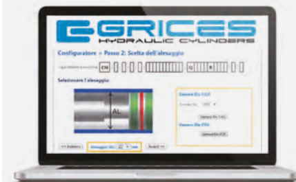
▲ Online configurator for cylinders, drawings, offers and orders.