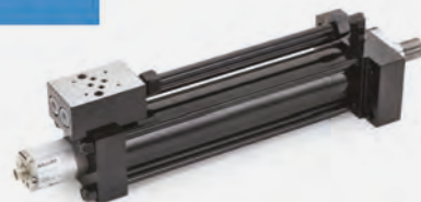
▲ Servocylinders with trasducer ISO6020/2, DIN24554.